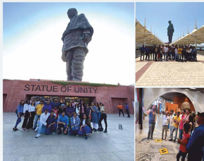
Visit to Statue of Unity, Kevadia