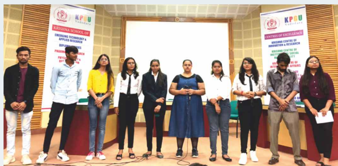
A Group of Sem-2 KSS Students performed a skit on World's Environment Day