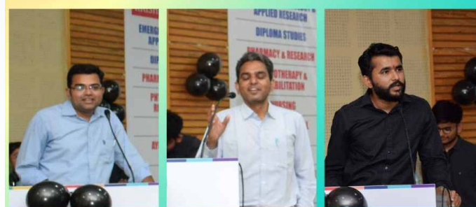
Faculties motivating the students for their future perspectives