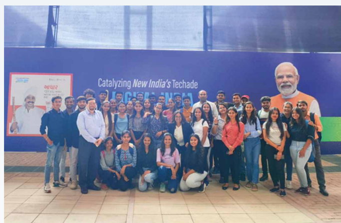
KSS students at Mahatma Mandir, Gandhinagar

KSS sem-2 students visited SSIP, Gandhinagar to Catalyzing New India's Techade, Digital India Week (July 4- 9, 2022) at Mahatma Mandir Convention and Exhibition Center, Gandhinagar, Gujarat.