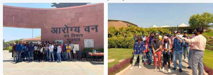
Visit at arogya van, forest department, kevadia