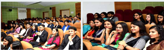
Audience enjoying the farewell function